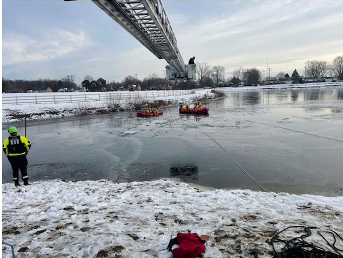
(Rescue and Boat 57 assisting West Chester at VOA Park)