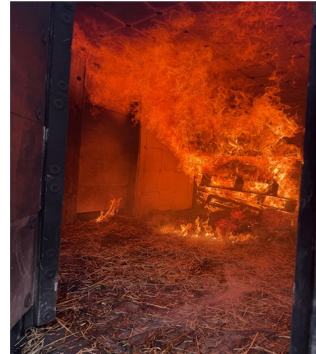
(DTFR Live Fire Training Joint Training Tower)

As noted in the third quarter report, the Turnout Gear Committee made the decision to reevaluate Lion turnout gear. While DTFR purchased Lion gear in the past, the overall feedback at that time was unfavorable, the committee felt it was appropriate to reassess the product based on changes the manufacturer has implemented. After multiple meetings with representatives from Lion, the company addressed prior concerns and outlined improvements to both the materials and manufacturing processes now being used. Lion also detailed enhancements to quality control measures, fit, and overall durability of the gear. Based on these discussions and the information provided, the committee determined that Lion warranted another evaluation moving forward. Five total sets of Lion gear were purchased in the fourth quarter.